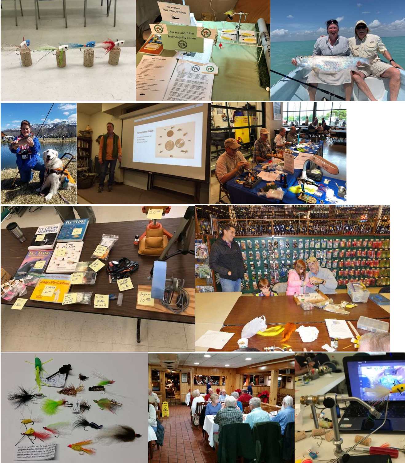
Some photos shared by members as well as taken at club sponsored events...these all represent Fellowship Through Fly Fishing at its best!