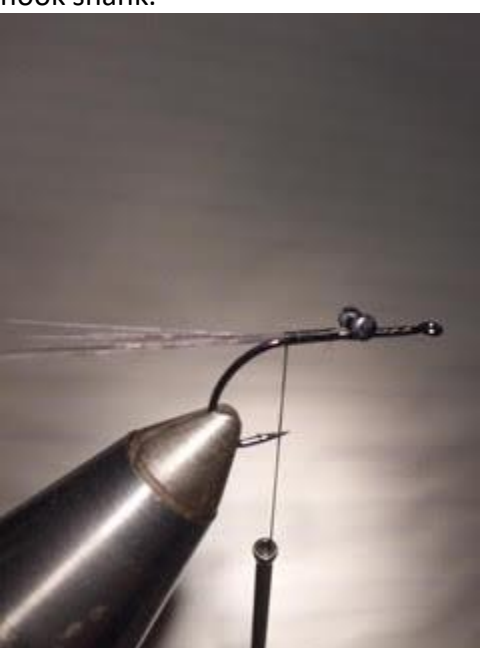
Tie in 1" EP Brush at bend of hook and wrap forward, stopping about half way towards the lead eyes. Brush out fibers to free any trapped fibers.