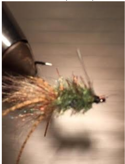
This looks like a great fly.