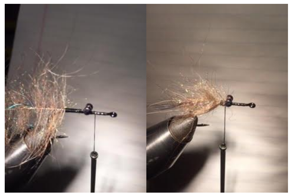
Tie in legs, two per side. Trim to just behind where paint brush bristles stop.